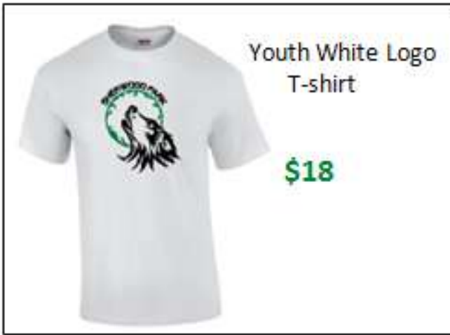
Youth White Logo T-shirt