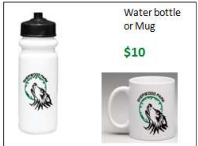
Water bottle or Mug